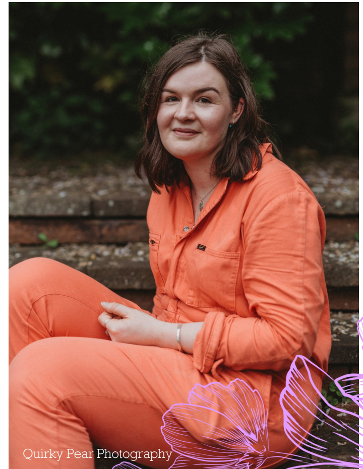
Quirky Pear Photography